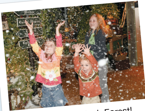
Snow in the Black Forest!