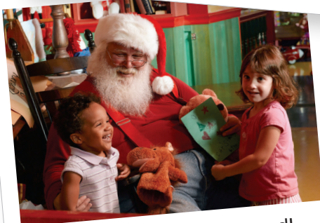
Visit with Santa year round!