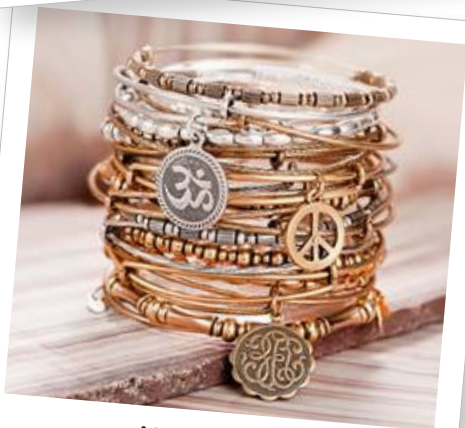
Alex and Ani®