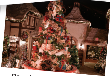
Bavarian Christmas Village